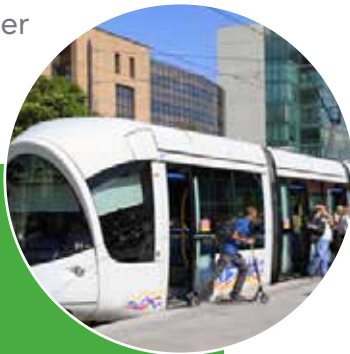
LRT in Lyon, France

Learn more and sign our petition in support of Light Rail Links at lightraillinks.com . Follow us on Facebook and Twitter @LightRailLinks.