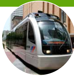
LRT in Houston, Texas