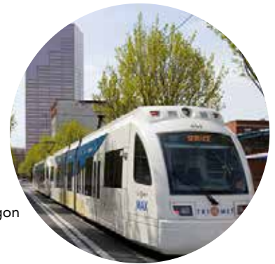
LRT in Portland, Oregon

"That's where the region is changing the most [Surrey] and that's where we need transit...It shouldn't be put off...If we put rapid transit in there, it would put a big impact on the development community on where it wants to go."