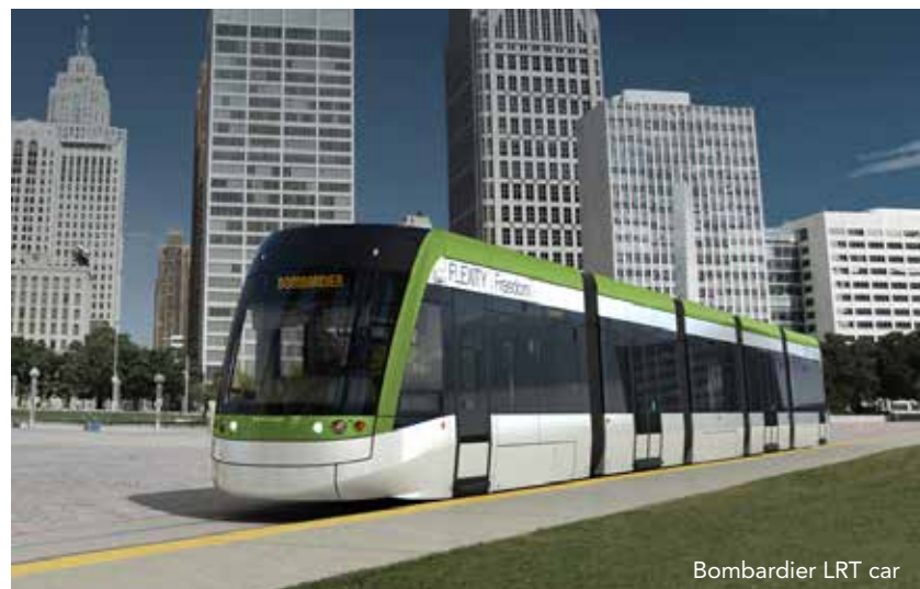
Bombardier LRT car

Light Rail Links is a coalition of community and business groups dedicated to securing Light Rail Transit (LRT) for south of the Fraser. We support LRT because it is the best technology to help shape growth and create livable neighbourhoods. Most importantly, the complete 27-km LRT system will help build and connect communities south of the Fraser.