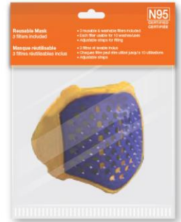
Colour subject to change.