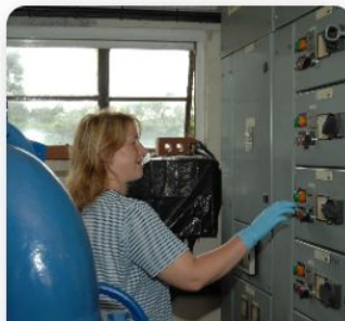
Wastewater Treatment and Distribution Operator